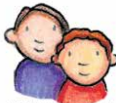
CAIN & ABEL