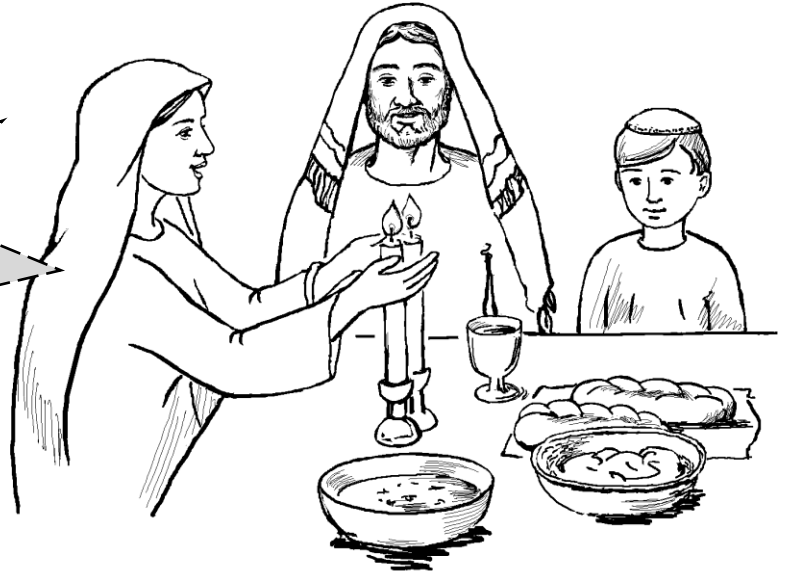
Jesus and his parents ate the Sabbath meal together.

When God had finished making everything, he rested. He blessed that day and made it a holy day.