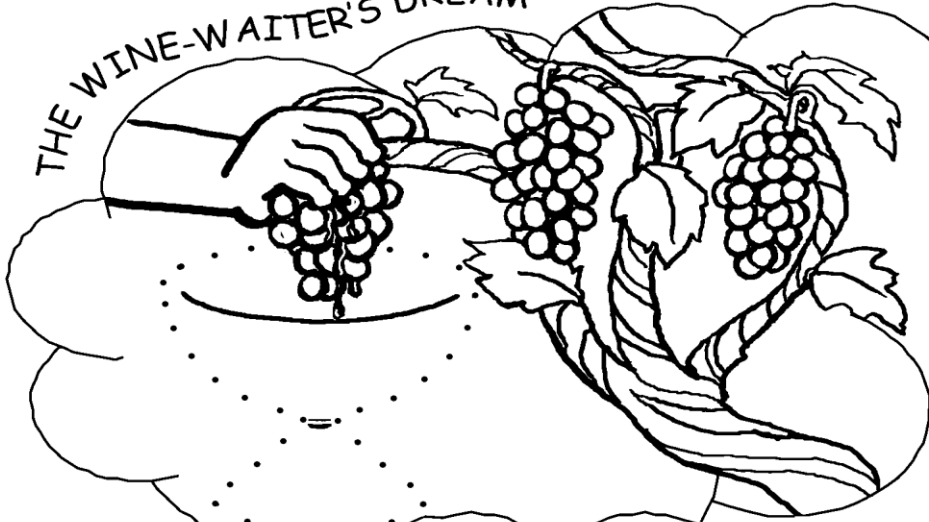
THE WINE-WAITER'S DREAM

After ___ days you will get your job back.