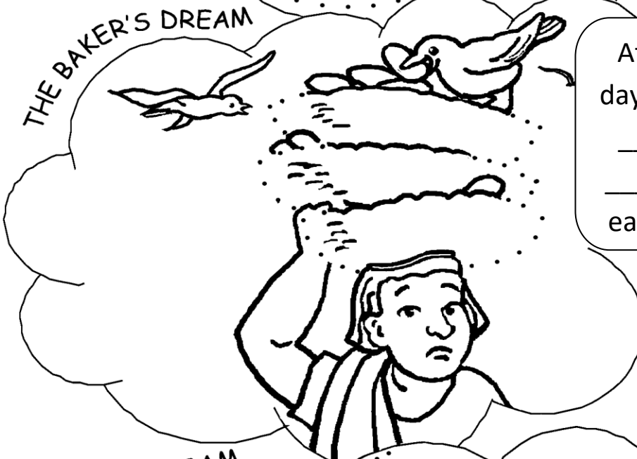
THE BAKER'S DREAM

After ___ days you will ___ and ___ will eat you up!