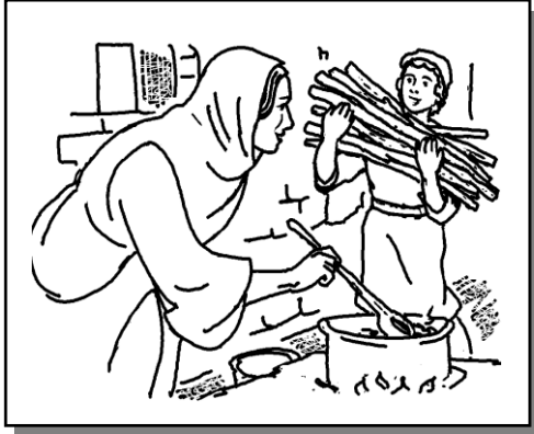
They ate together.