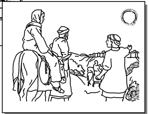
They travelled together..